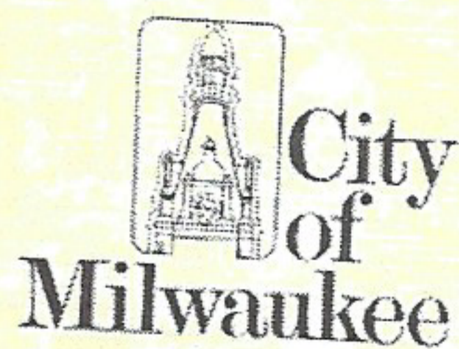
Small Business Development Director

This certificate supersedes any certificate previously issued. If there are any changes regarding the information (i.e. business structure, ownership, day-to-day management, operational control, addresses, phone and fax numbers or authorized signatures) provided in the submission of the business application for certification as a SBE, you must immediately (within 30 days of such changes) notify the Office of Small Business Development in writing. The Office of Small Business Development reserves the right to conduct a compliance review at any time to confirm certification eligibility. Furthermore, certification may be suspended or revoked upon findings of ineligibility.